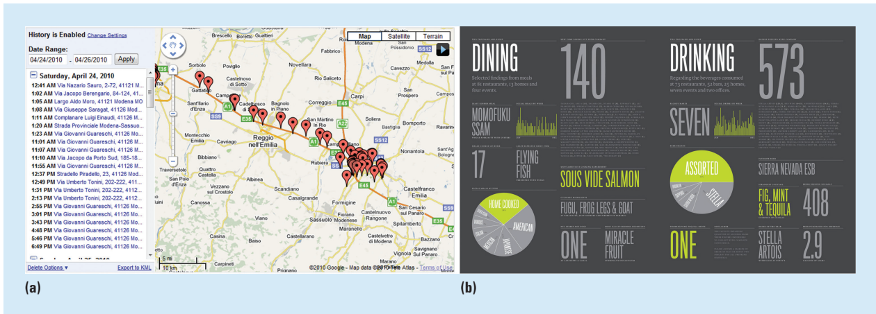
Figure 2. Two representative examples of current diary-oriented systems. (a) The Google Latitude application, which records user whereabouts; (b) a Feltron report of a user's daily habits.

to Google Latitude, could complement this application by adding location information. Similar objectives characterize Context Watcher ( http://portals.telin.nl/contextwatcher ), which can connect with external sensors.